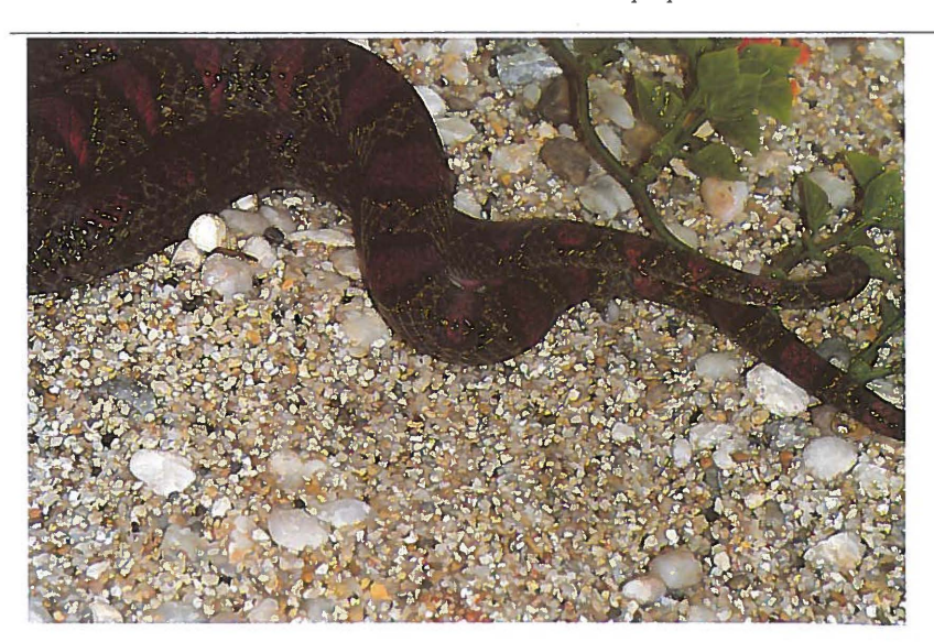
Foto 2: Lampropeltis mexicana mexicana , in copula. Foto H.v.d. Eerden.