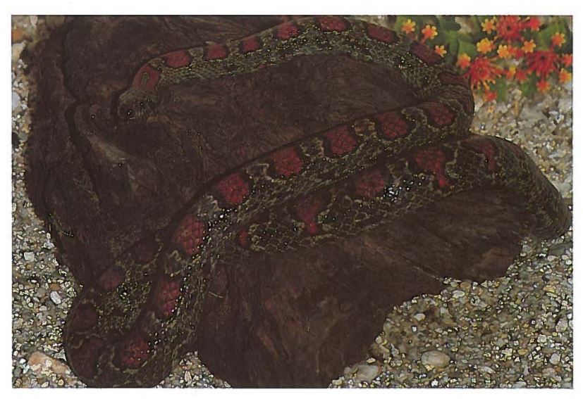
Foto 3: Lampropeltis mexicana mexicana , vrouw, female.